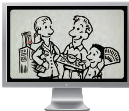
Through partnering with Twin Cities Public Television and Citizens League and support by The Bush Foundation, a video was produced to show how rising health care costs are taking dollars from other key social determinants of health, and why citizens and clinicians need to discuss this issue.

Embedding affordability and a concept of value-added care into guidelines, initiatives and the ICSI website supported efforts to bring the same degree of legitimacy to addressing the cost of care as ICSI did previously with quality and experience of care.