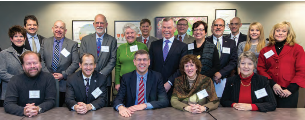
Minnesota health care leaders who collaborated on ICSI’s HTDI initiative met with U.S. Rep. Eric Paulsen (center). He noted that ICSI’s work influenced a bi-partisan bill submitted to Congress supporting a national clinical decision-support approach for ordering HTDI scans for Medicare patients.

the American College of Radiology (ACR) National Advisory Group for Decision Support, ICSI continues to provide feedback on ACR’s appropriateness criteria development and revision process.